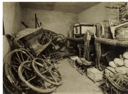
The objects that were in a room in the tomb.